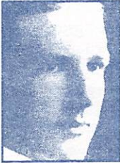
Cameron Townsend 1934 (Linguistic Barriers)

This era was begun by a pair of young men of the Student Volunteer Movement: Cameron Townsend and Donald McGavran. Cameron Townsend was in so much of a hurry to get to the mission field that he didn't bother to finish college. He went to Guatemala as a "Second Era" missionary, building on work which had been done in the past. In that country, as in all other mission fields, there was plenty to do by missionaries working with established national churches.